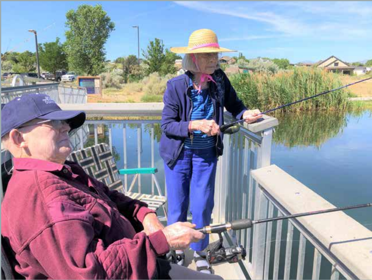
🚣 A Fisherman and the catch of his life! 🚣