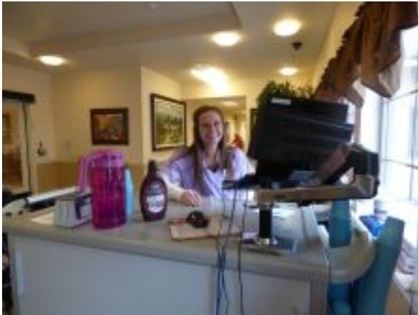
She has a nice smile, don't you agree?