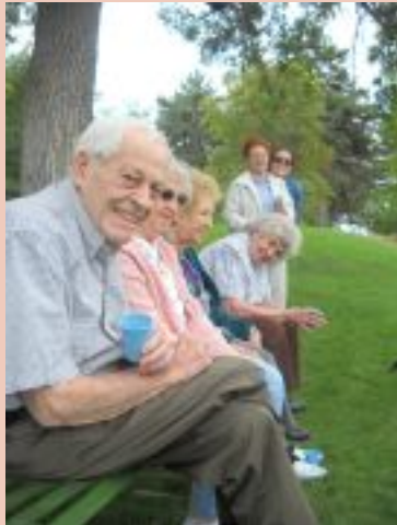
Relaxing at Liberty Park!