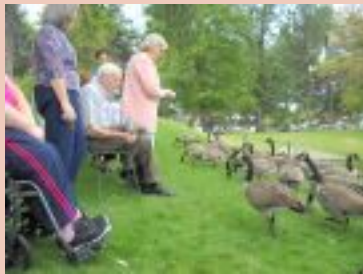
The geese definitely weren't shy!