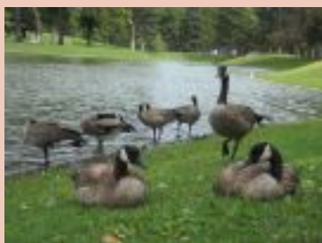
Stomachs are full!