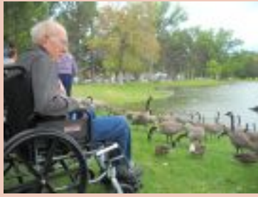
A man and his geese!