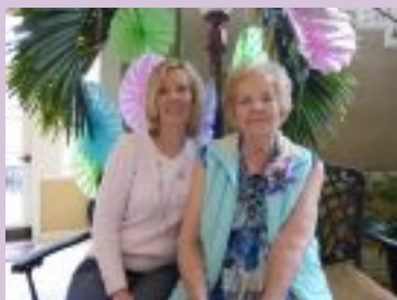
Violet and Daughter