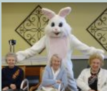
BEAUTIFUL LADIES OF CARRINGTON COURT!