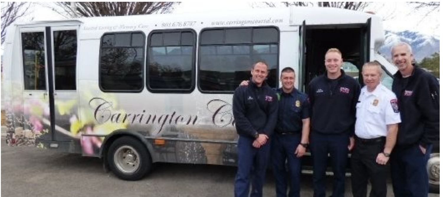
Stopping by and visiting and thanking our South Jordan Firefighters.