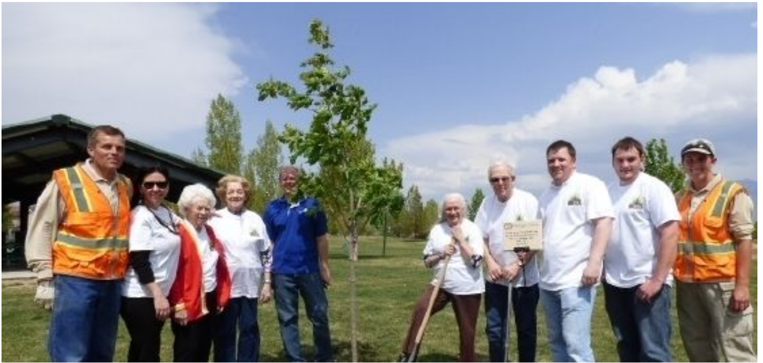
Planting one of our trees at the South Jordan Park for Earth Day.