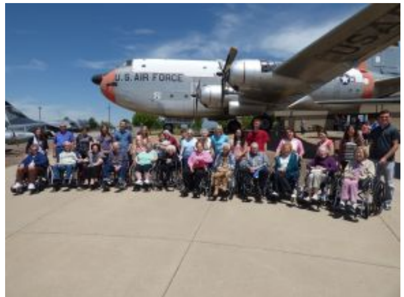
Carrington Court at Hill Aerospace Museum