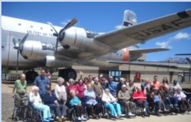
The gang from Carrington Court at Hill Aerospace Museum.

1928 West 9800 S • South Jordan, UT 84095 • (801) 676-8787