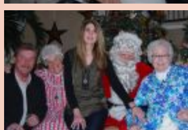
"HAPPINESS AT THE HOLIDAY"