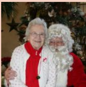
NAUGHTY OR NICE????