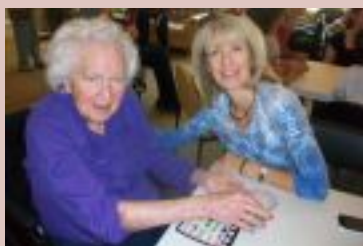
"Ice Cream Social"