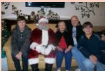
"All About Fun!!"